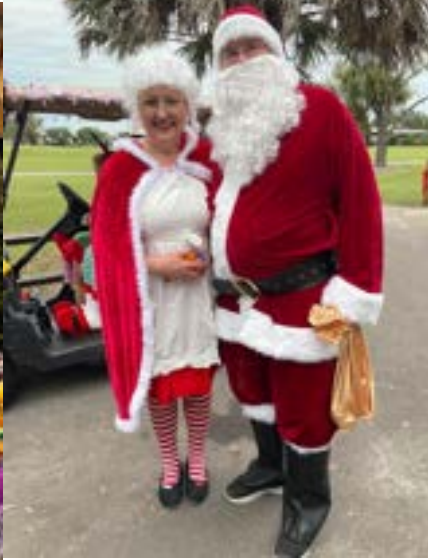
Santa & Mrs. Claus at the parade.