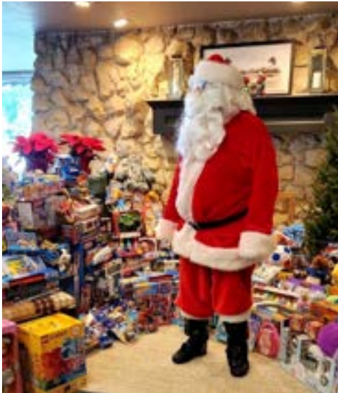
Santa at the Rotary Toy Drive.