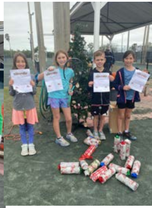
JR 2022 Santa Slammer Winners