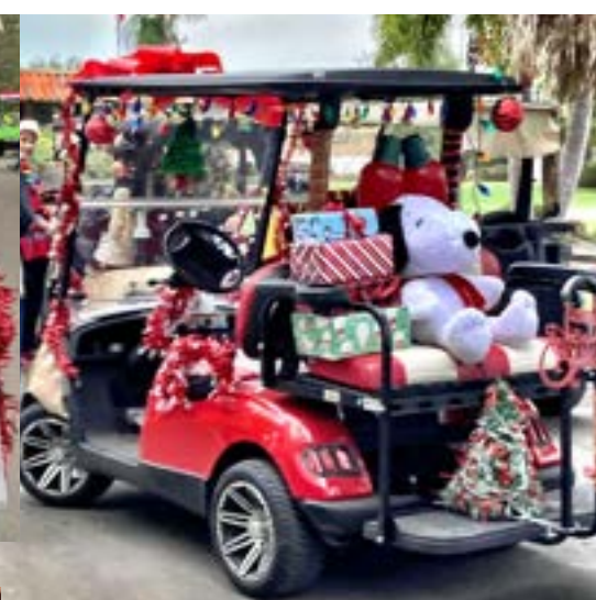
Snoopy at the Parade!