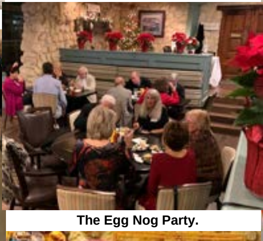
The Egg Nog Party.