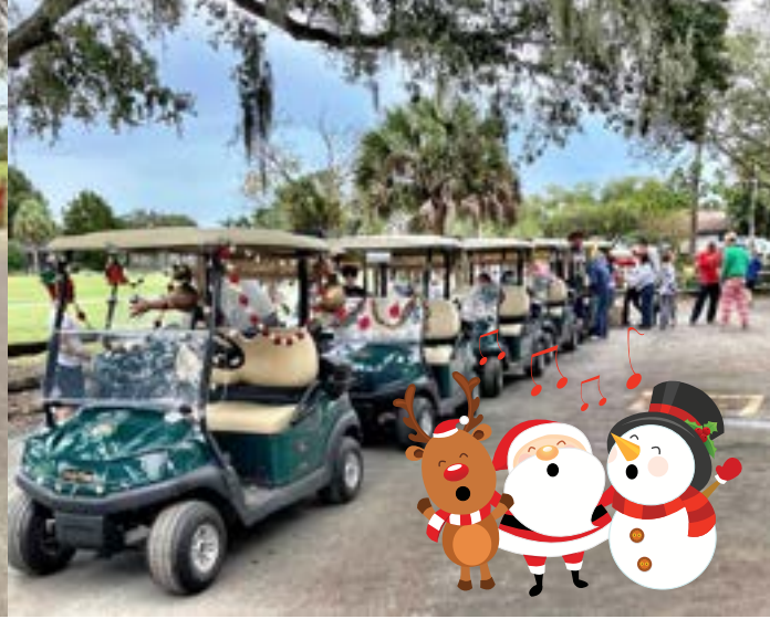
Lining up for the Christmas Parade.