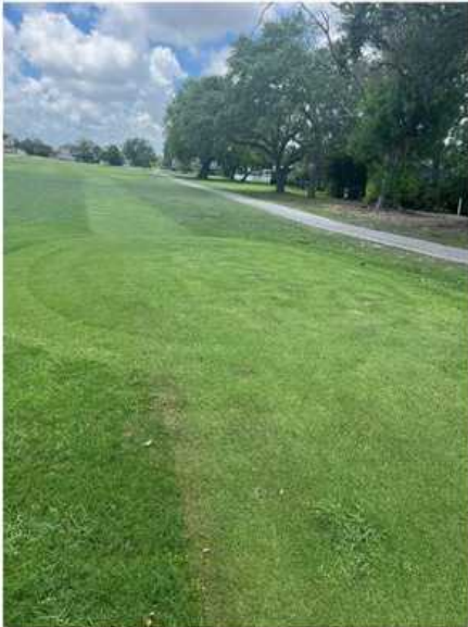
# 2 ladies tee has been re-sodded.