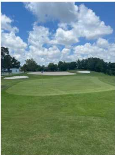
This is the temporary green on one with the original green waiting for sprigs next week.