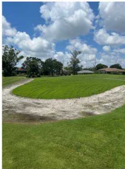
# 3 green has been expanded and is waiting to be stripped.