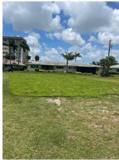
We added a par 5 tee to # 13.