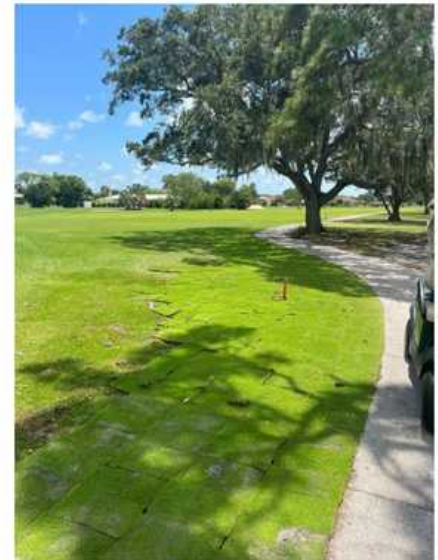
Sod was planted left off # 5 green by the cart path.