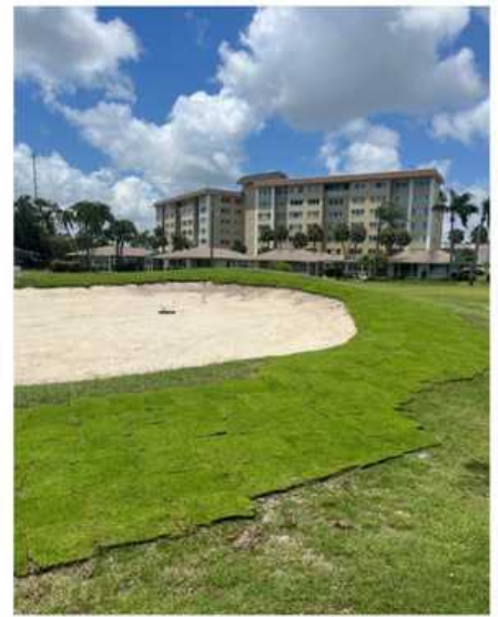
Bunker edge on # 12 has been re-sodded along with many others.