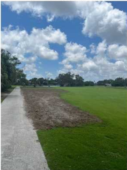
We are growing grass along the entire right side of # 8.