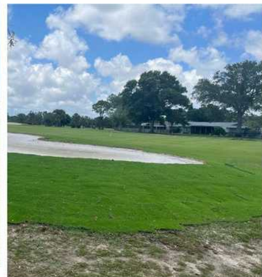
Hole #11 was re-sodded.