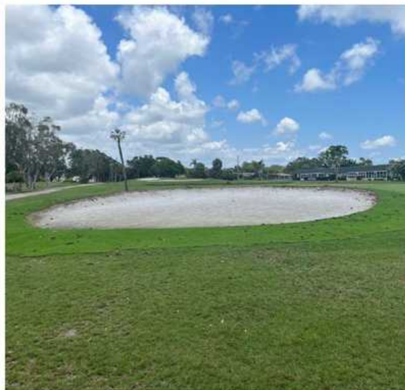
Hole #8 was re-sodded.