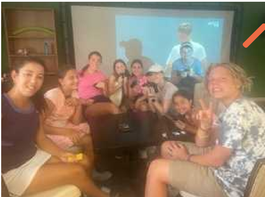
Summer Camp is going strong.

We will be hosting a USTA Junior tournament July 8-9.