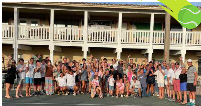
Our Spanish exchange students.