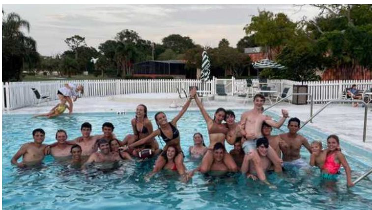
Fun at Summer Camp!