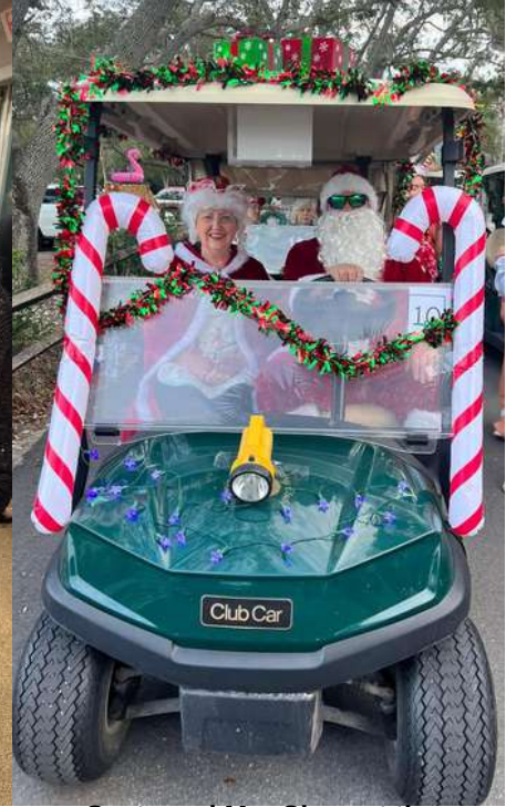
Santa and Mrs Claus at the Christmas Cart Parade