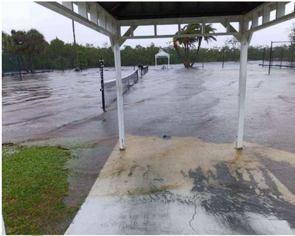
Tennis Flooding from Hurricane Helene