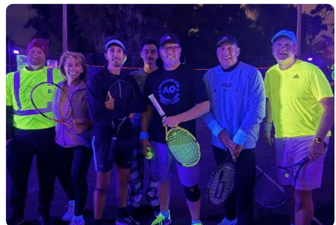
New Year's Eve-Eve Cosmic Tennis party