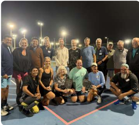
Pickleball Moneyball Event