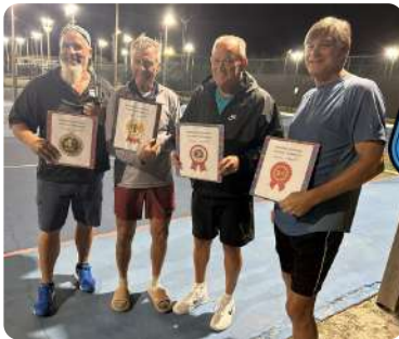
Moneyball Event Winners