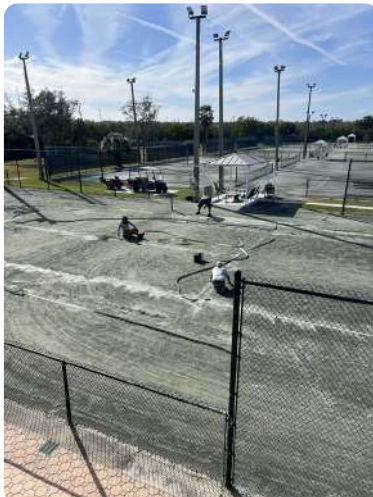
Tennis court reconstruction