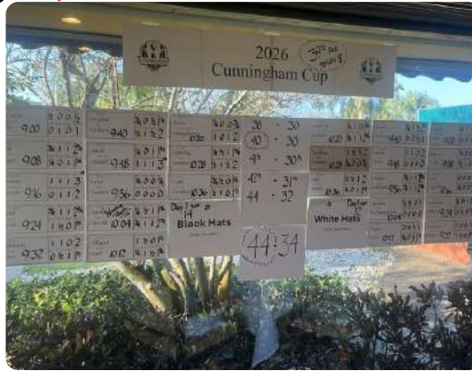
Cunningham Cup Scoreboard